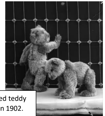
The first jointed teddy bears made in 1902.