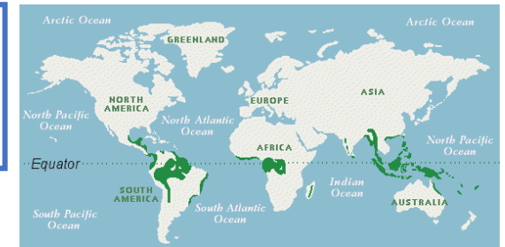
Map of the world's rainforests